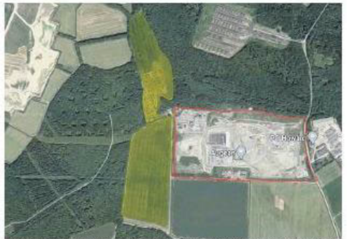
Augean's Kings Cliffe site with the new proposed area for landfill (highlighted in yellow) and the existing site (red)

sources of this type of waste such as hospitals".